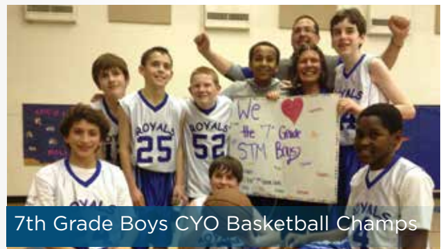
7th Grade Boys CYO Basketball Champs