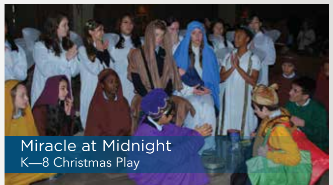
Miracle at Midnight K—8 Christmas Play