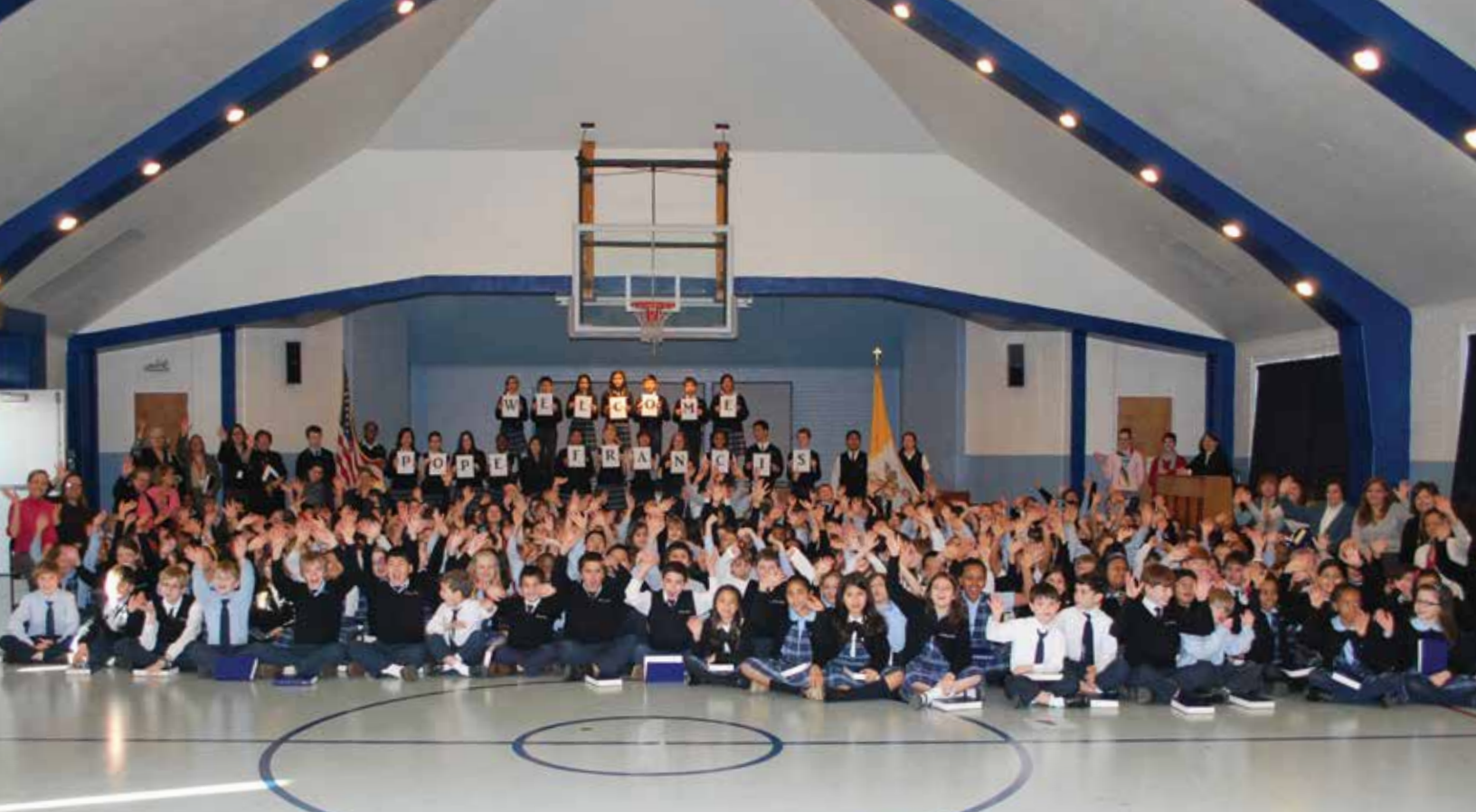
STM students tweet Pope Francis a welcome message.