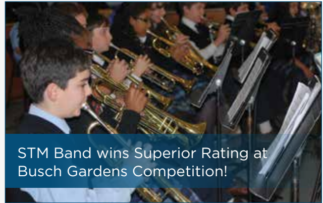
STM Band wins Superior Rating at Busch Gardens Competition!