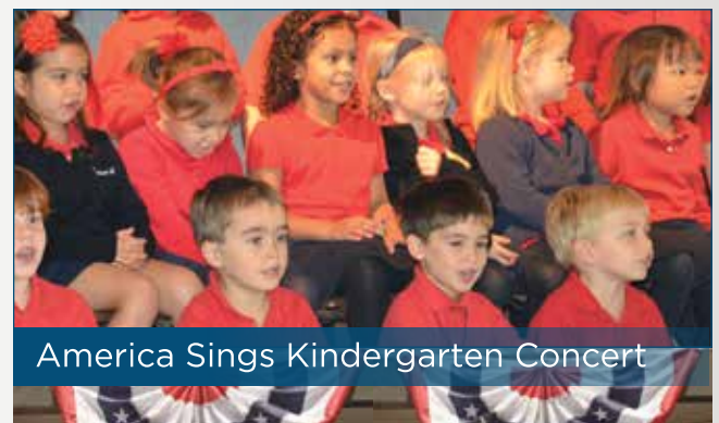
America Sings Kindergarten Concert